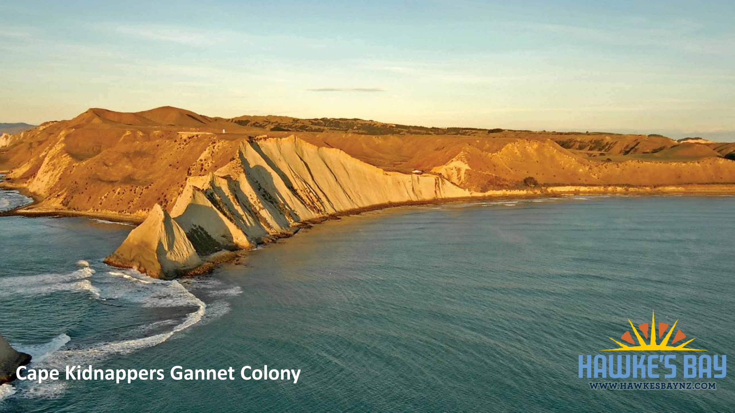
Cape Kidnappers Gannet Colony